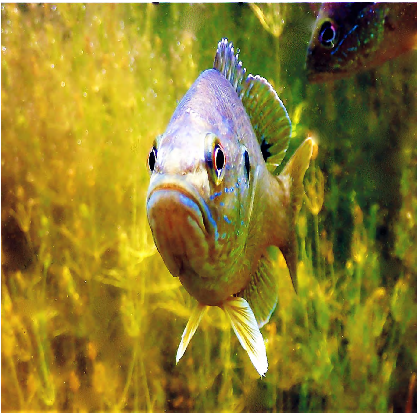
Photo of grumpy looking green sunfish "forcefully" asking you to become a member, and/or to donate now to MWA by Scott Brown